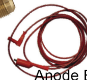
Anode Ext. Lead