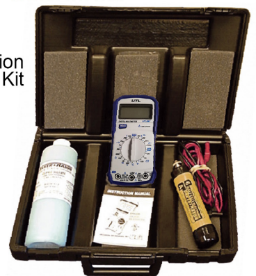
Cathodic Protection Testing Kit

Bergquist free on-site Cathodic Protection Training. Contact your Area Sales Manager to set up a class time.