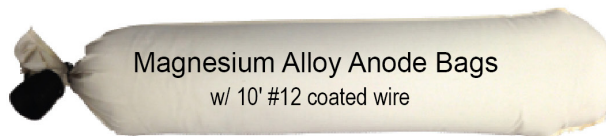
Magnesium Alloy Anode Bags w/ 10' #12 coated wire

shown with digital multi-meter & half cell