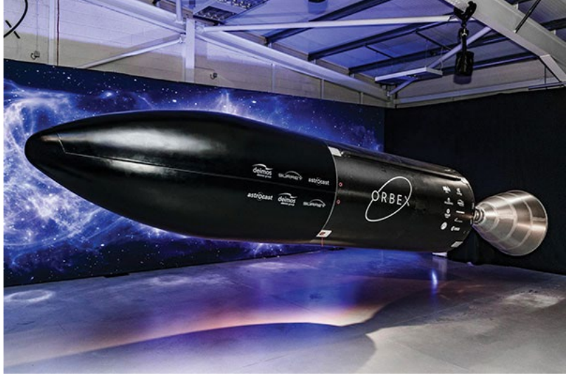
Aerospace company Orbex is turning to renewable propane to power space rockets.

Larmour explains that the company turned to LPG to power its rockets because of its unique physical property in that it does not freeze when chilled down to a similar temperature as liquid oxygen.